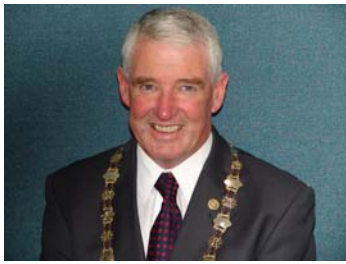
Alan Livingston, JP Mayor