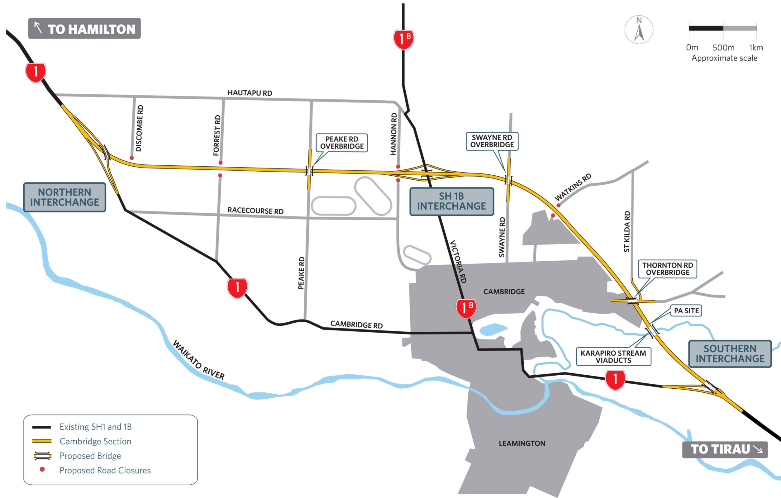
Figure 2.0 – Expressway Map