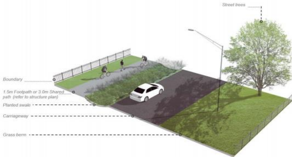
Example image: Typical 18m street with separated 3m shared cycle path or 1.5m footpath (refer structure plan) and vegetated drainage swale