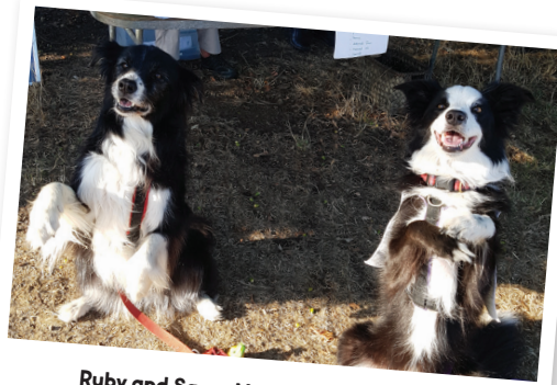
Ruby and Sassy McPup show they know their manners at the Polo grounds event.