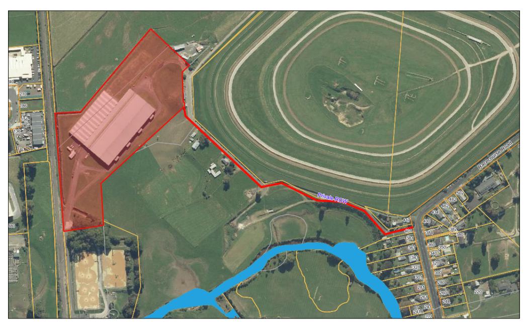
Figure 1: Council's GIS map showing accessway for the adjoining site (highlighted in red) intertwined with subject site

Reasons for request: It's not clear how the other sites that appear to have access to the existing vehicle crossing will be serviced.