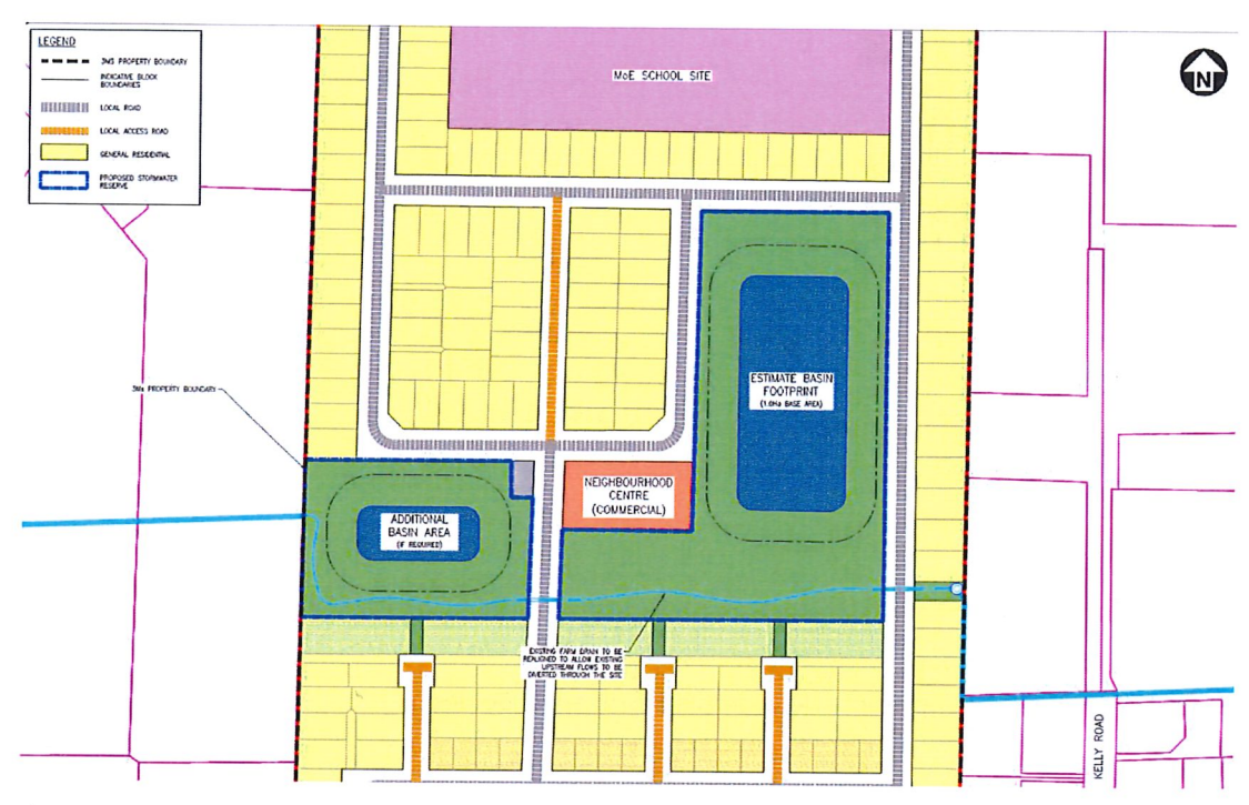
Figure 1 - Alternative Stormwater Solution (General Arrangement)

A high-level assessment was undertaken to confirm the feasibility of the 3MS central soakage basin concept. Table 1 below summarises of the initial design parameters used and initial basin sizing calculated based on a 1% AEP storm event.