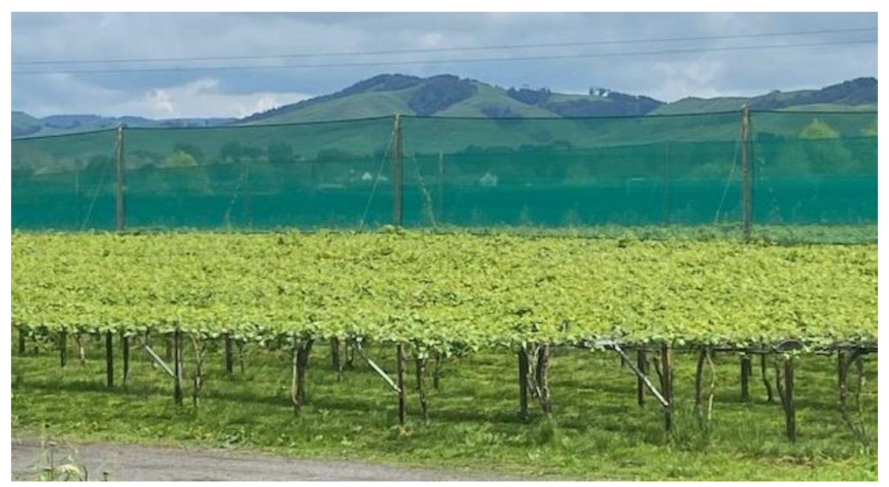
Figure 13: Screens with Dwellings on Maungatautari Road Visible in Background