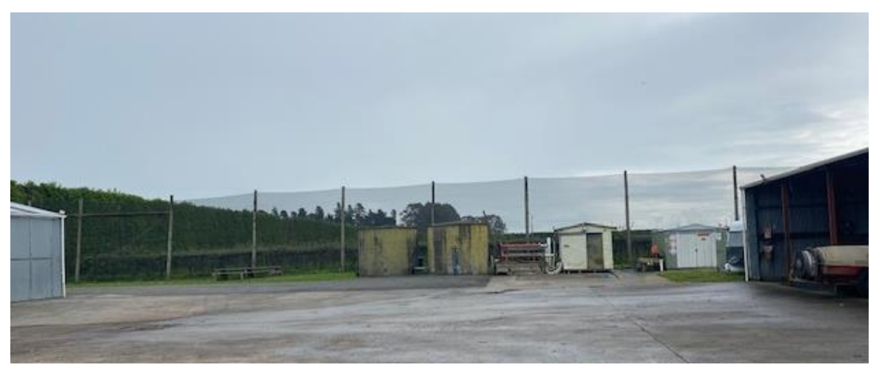
Figure 4: Existing Vertical Screens