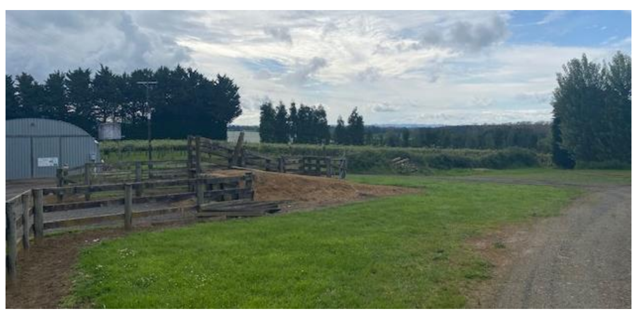
Figure 10: Existing Plantings at Southern End of Property