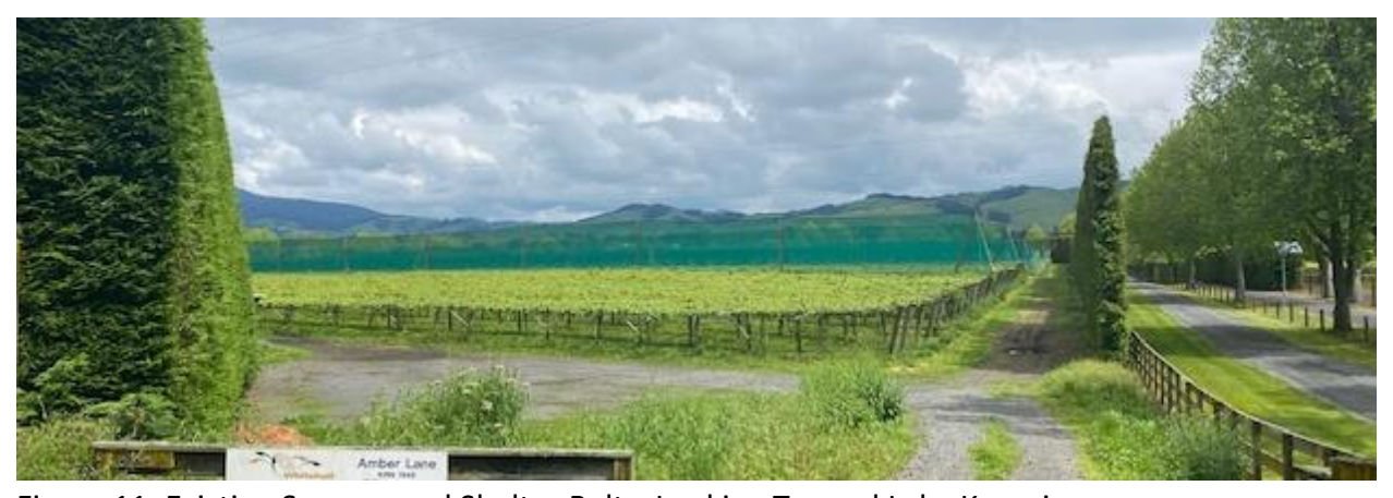
Figure 11: Existing Screens and Shelter Belts, Looking Toward Lake Karapiro