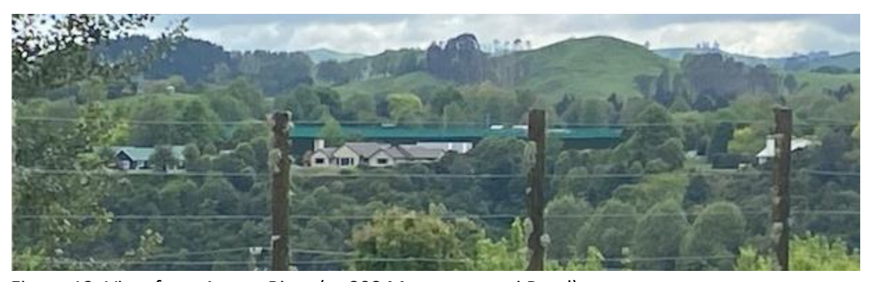
Figure 12: View from Across River (at 808 Maungatautari Road)