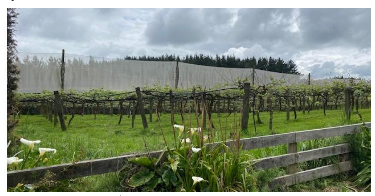
Figure 22: Existing Screens within Site