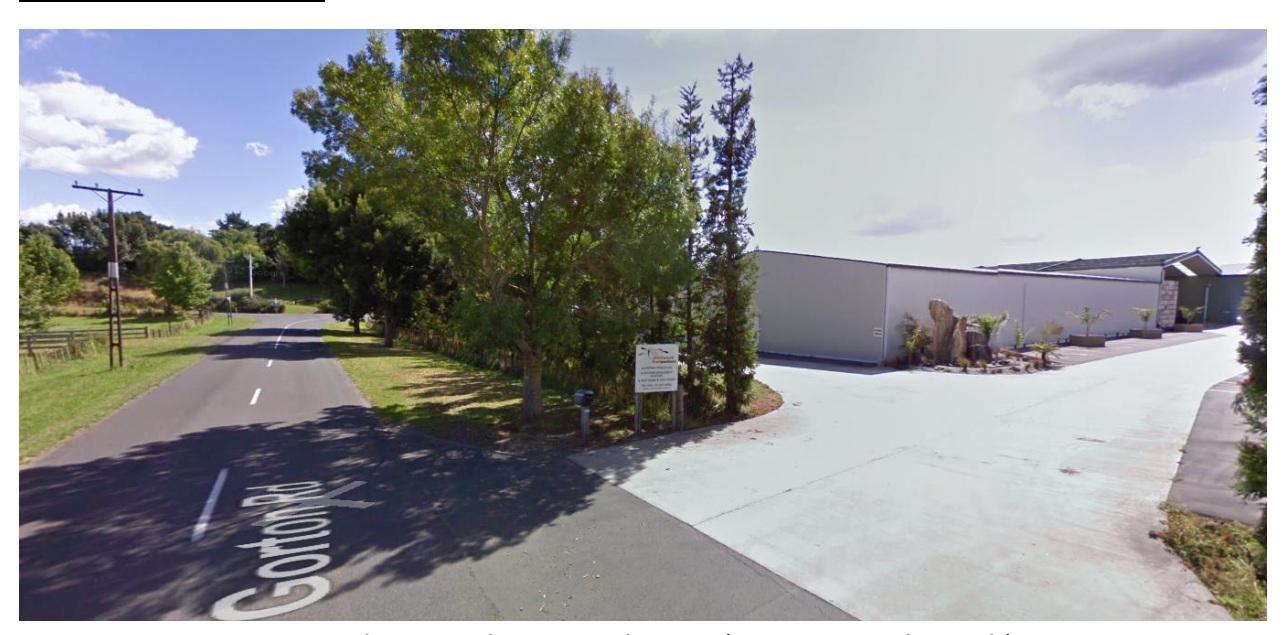
Figure 16: Entrance to Coolstore and Existing Planting.