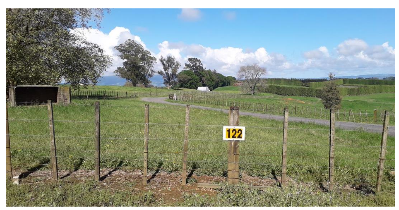
Figure 17: Site As Viewed from the Road