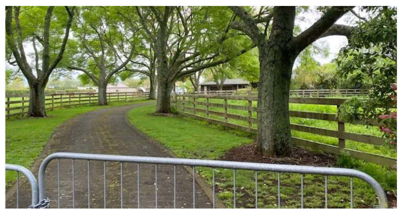
Figure 19: Driveway to Existing Dwelling