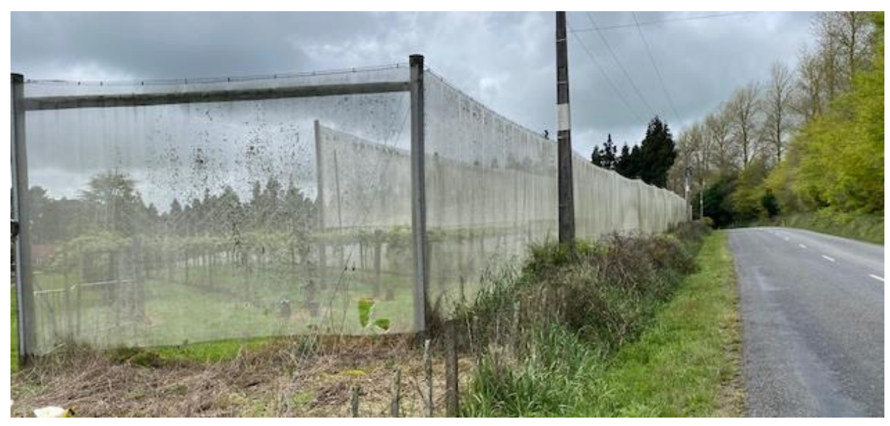
Figure 21: Artificial Screen on Roadside