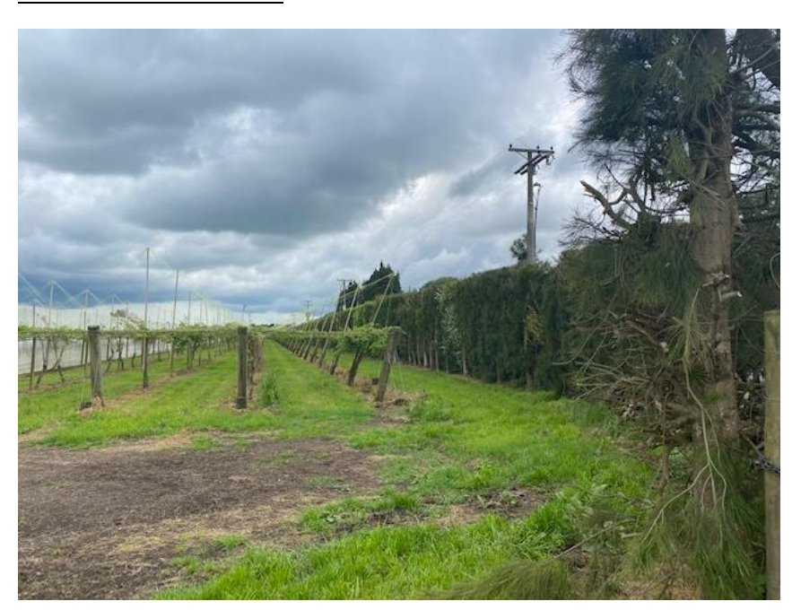
Figure 1: Hedging on Front Boundary