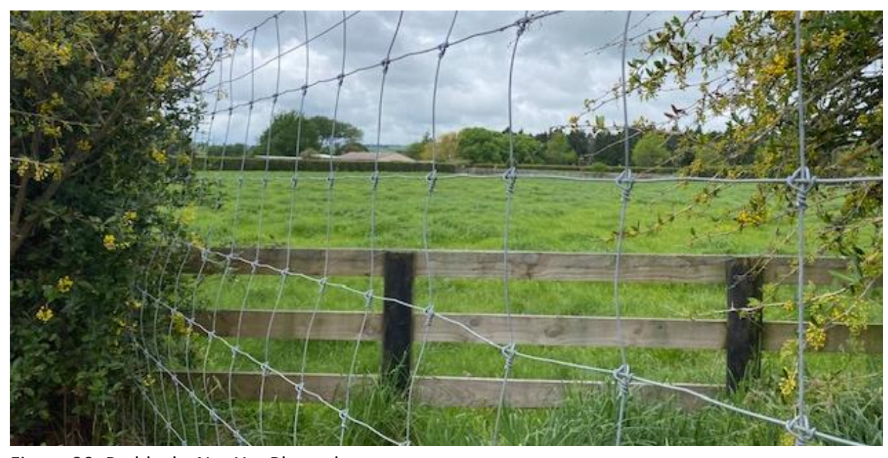
Figure 20: Paddocks Not Yet Planted