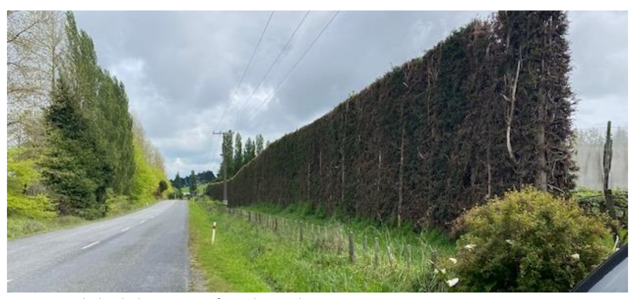
Figure 23: Shelterbelt on Parts of Road Boundary