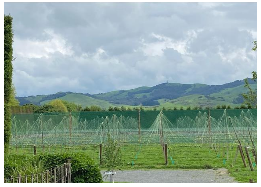
Figure 6: Existing Screens and Shelterbelts – Looking Toward Lake Karapiro