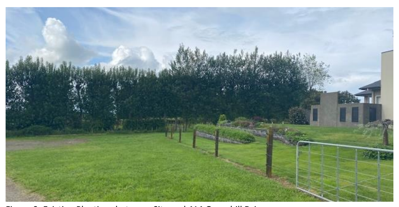
Figure 9: Existing Plantings between Site and 414 Greenhill Drive