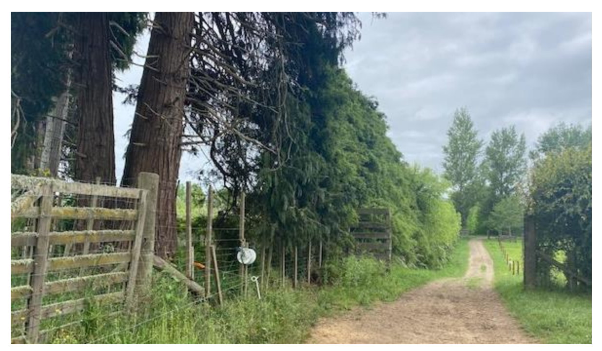
Figure 15: Existing Shelterbelt along Parts of Shared Boundary of 714 and 808 Maungatautari Road