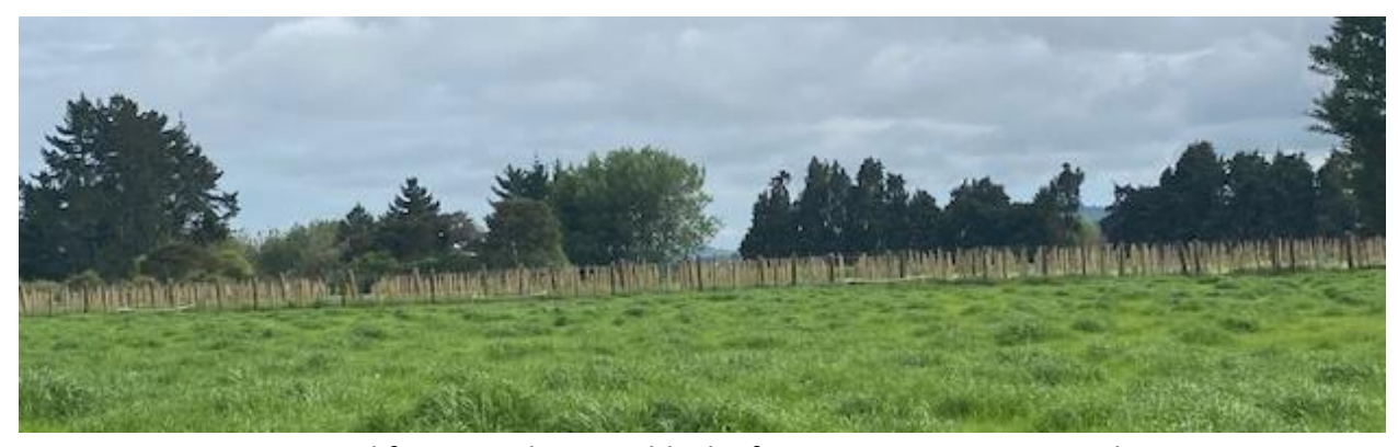
Figure 14: Site As Viewed from Southern Paddock of 808 Maungatautari Road