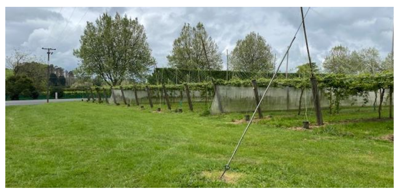
Figure 8: Shelterbelt in Background, Northern Boundary open to the Road