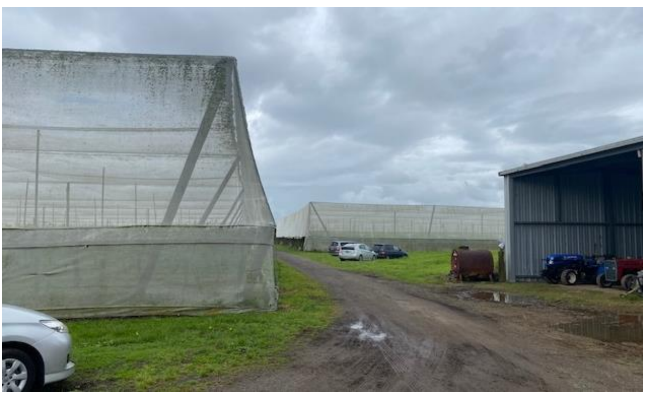
Figure 3: Existing White Screens and Shed