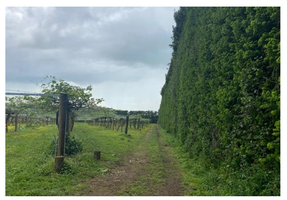
Figure 5: Existing Shelterbelts – Brotherhood Road to the Right and Arapuni Road in the Background