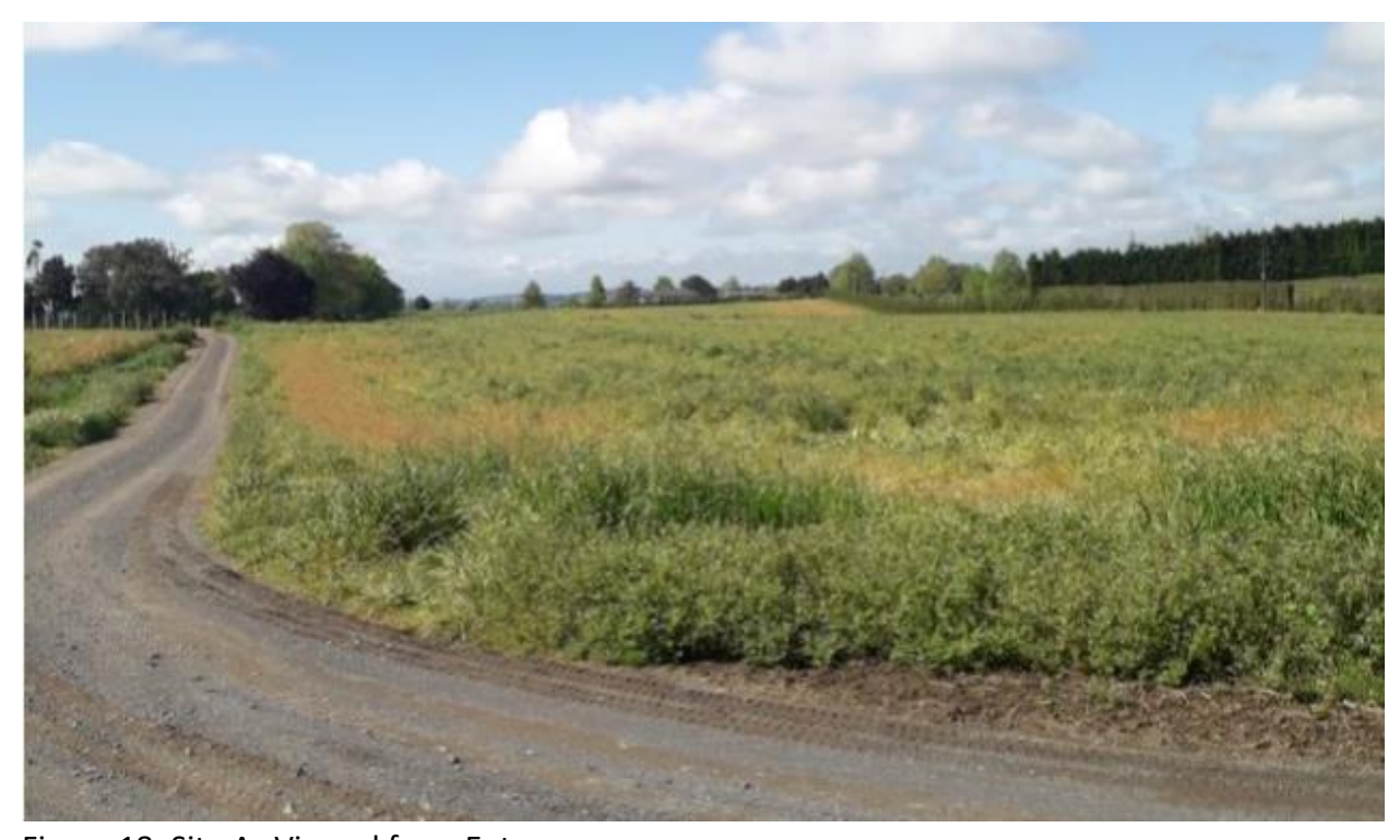
Figure 18: Site As Viewed from Entrance