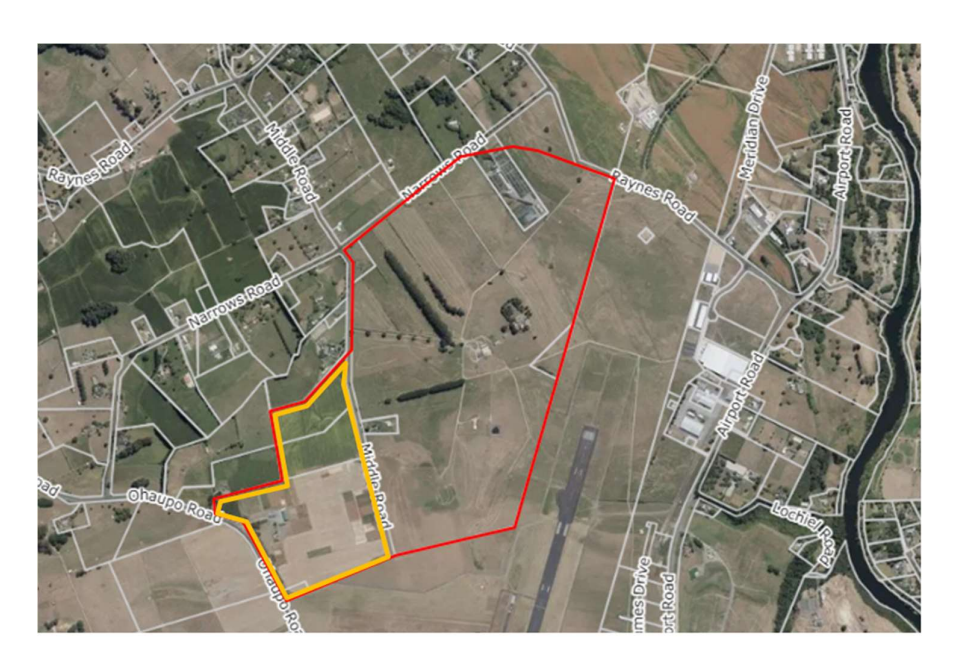
Figure 1 – RPL Site (shown in yellow, PC20 site shown in red)

8. The RPL Site is approximately 29 ha and fronts Ohaupo Road/State Highway 3 and Middle Road as shown in Figure 1 below.