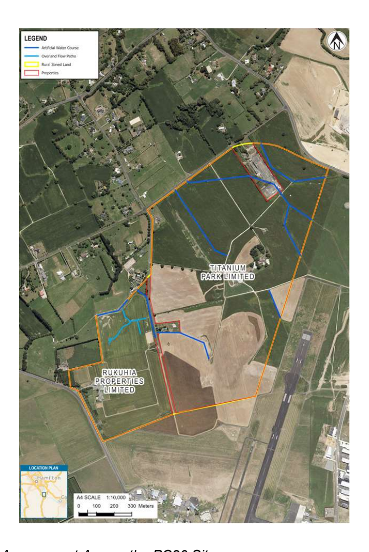
Figure 3: Watercourse Assessment Across the PC20 Site