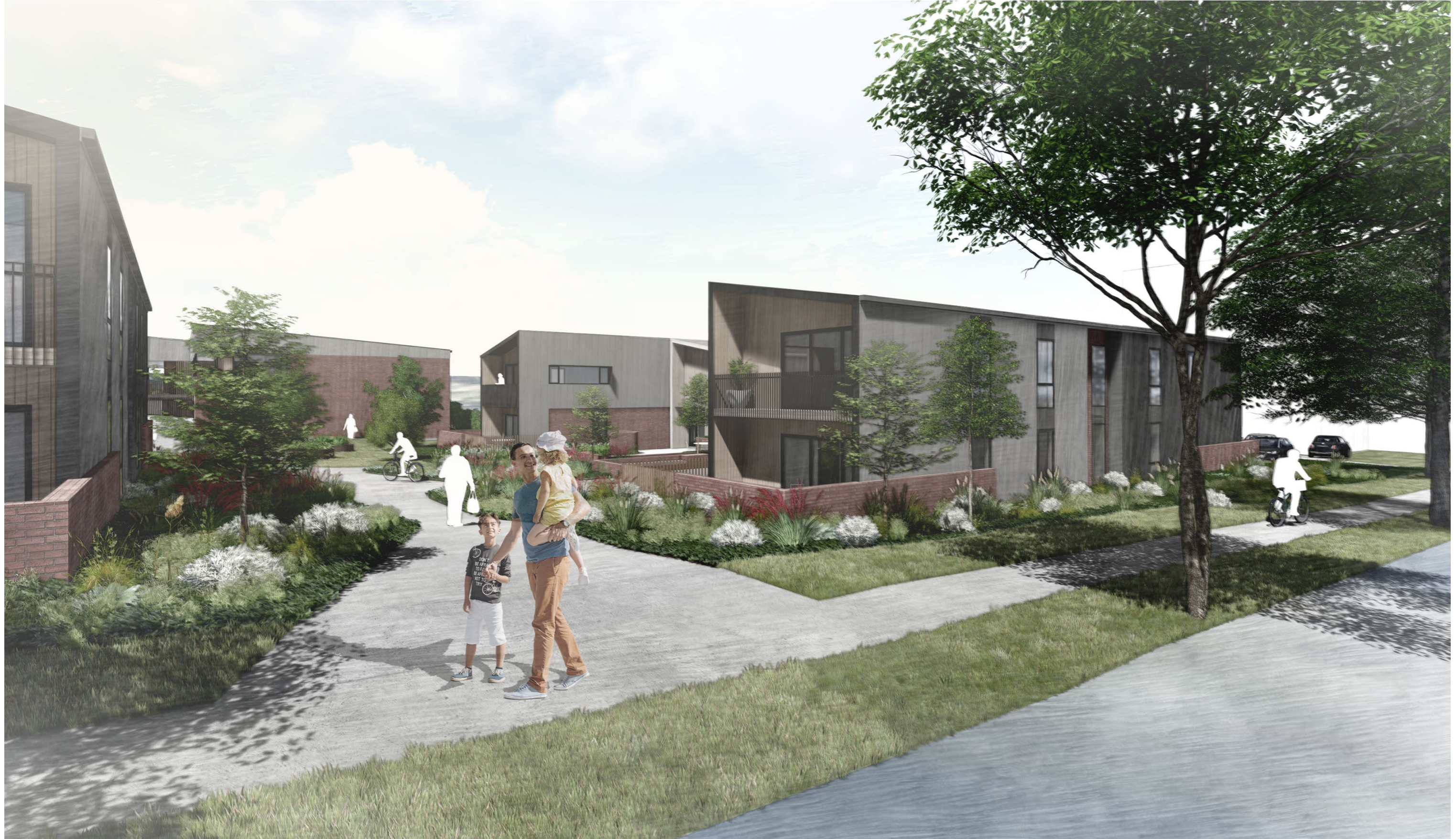
PALMER ST PERSPECTIVE