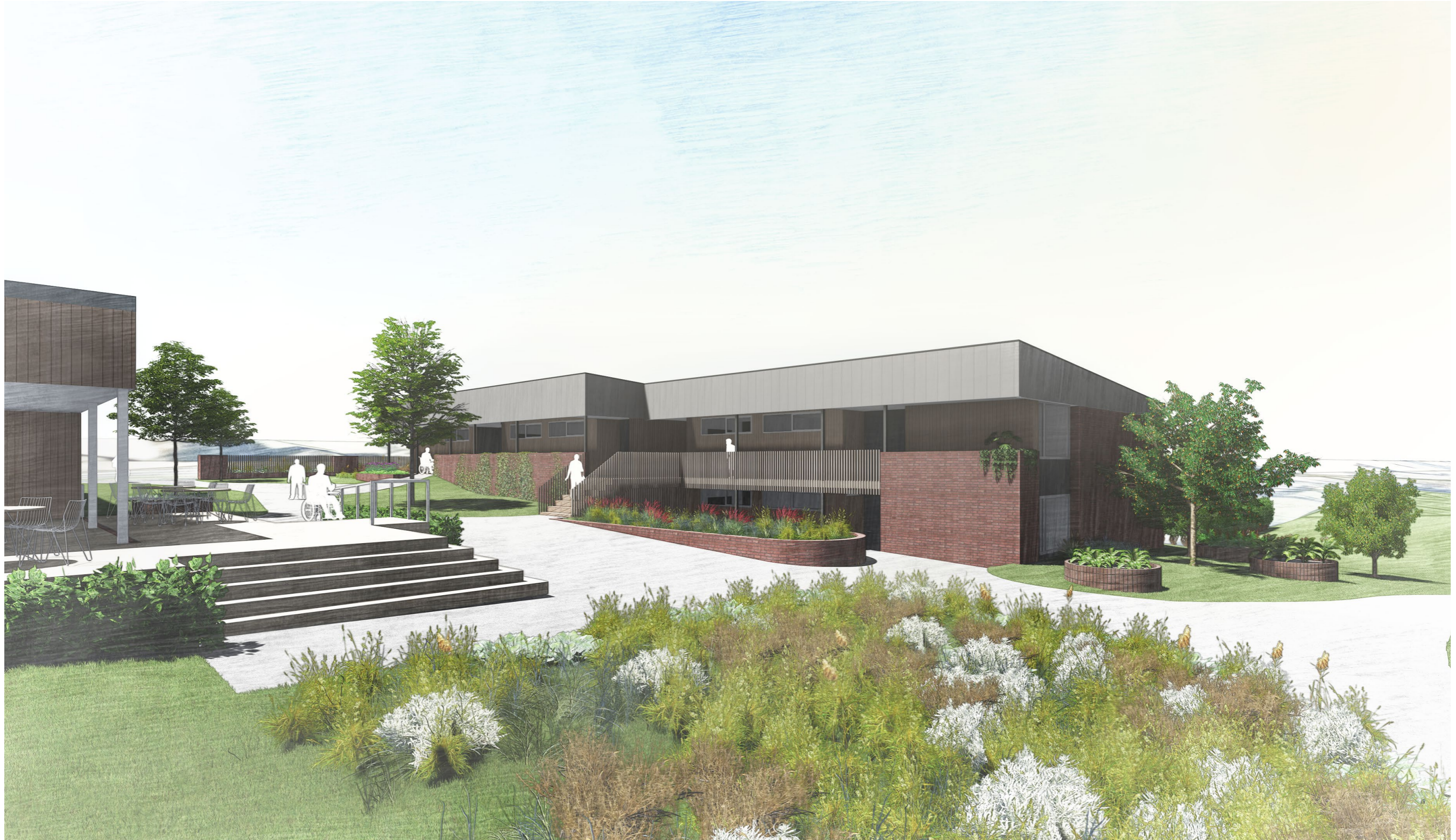
SOUTH WEST PERSPECTIVE