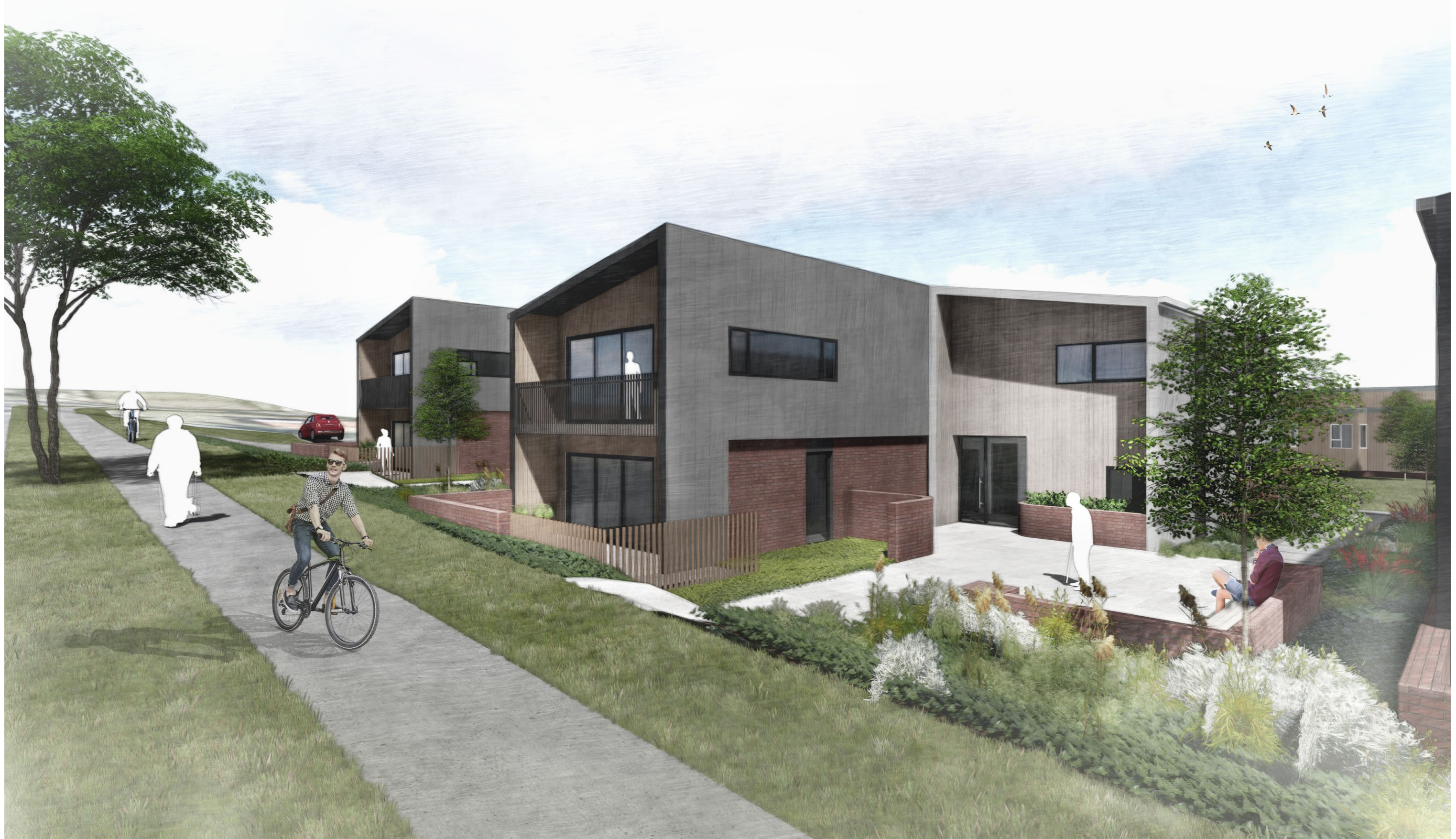
PALMER ST PERSPECTIVE