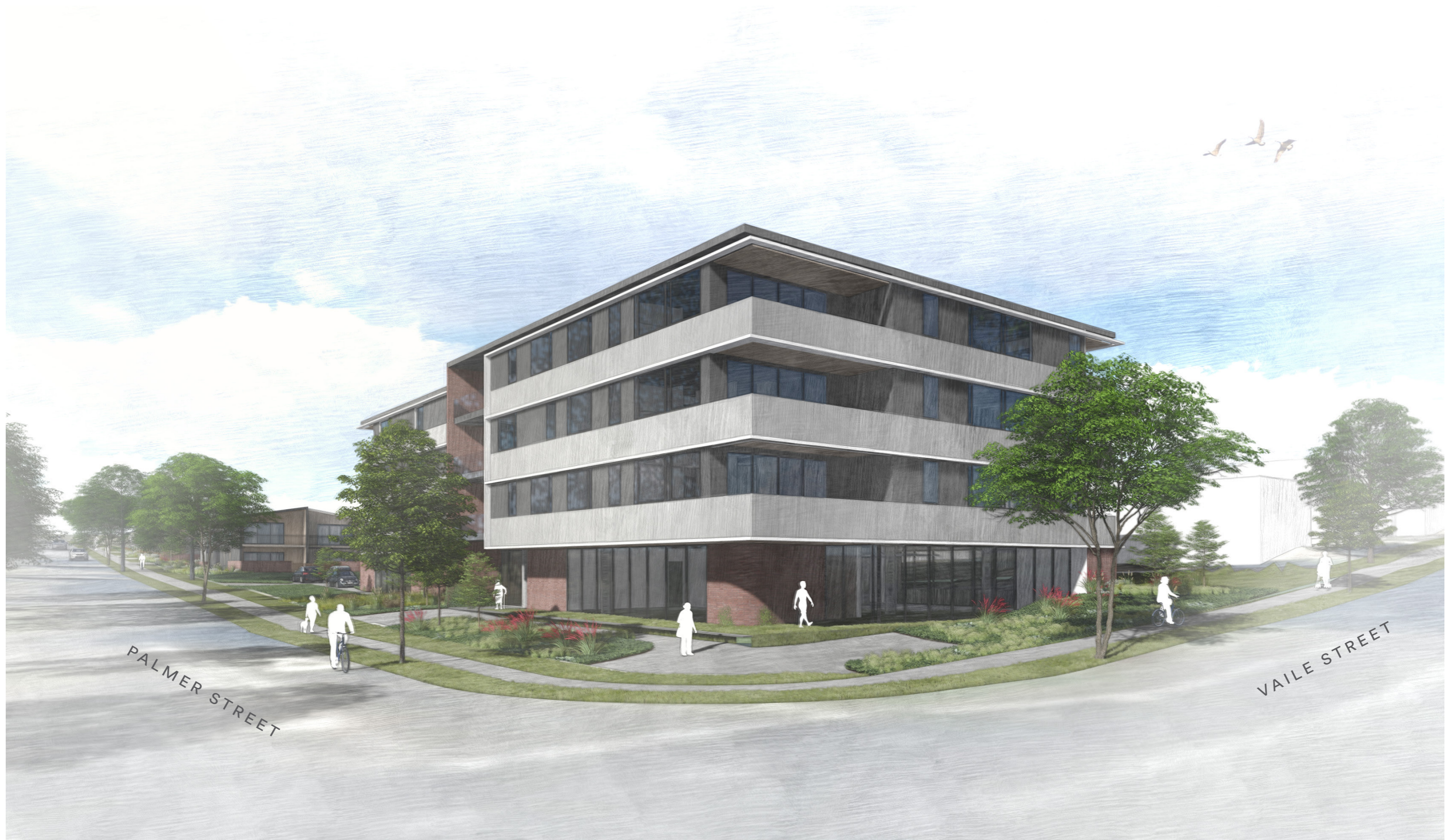
PERSPECTIVE VIEW - CORNER PALMER & VAILE ST