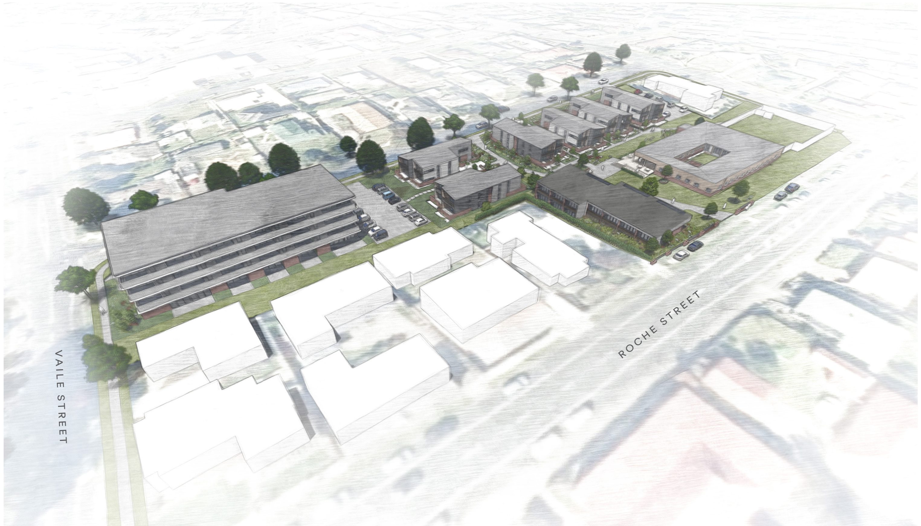
OVERVIEW - CORNER OF VAILE & ROCHE STREET