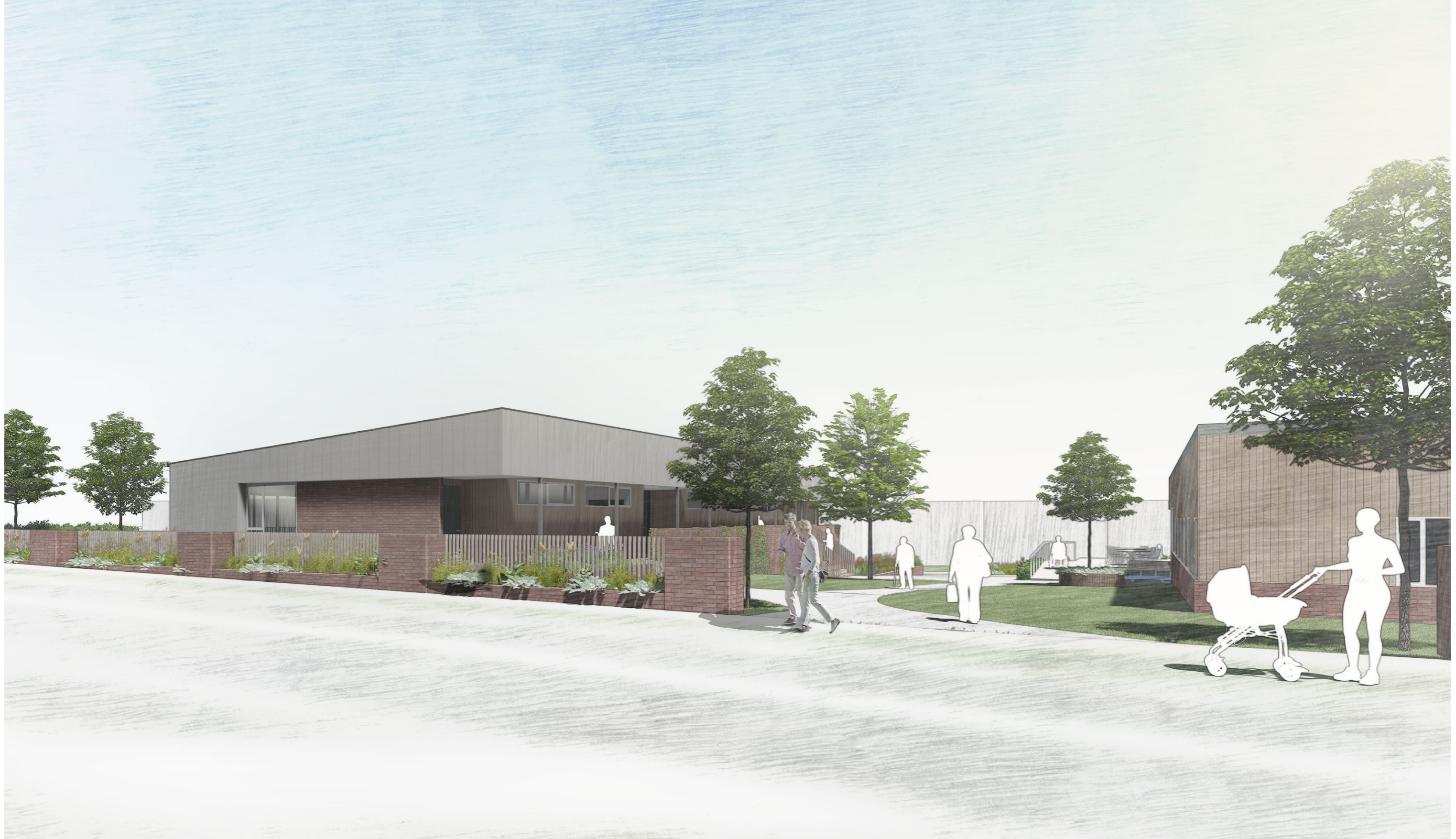
ROCHE STREET PERSPECTIVE